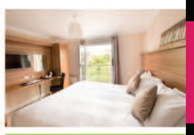
BRIGHT & AIRY BEDROOMS